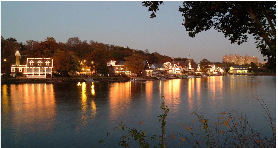
Boat House Row