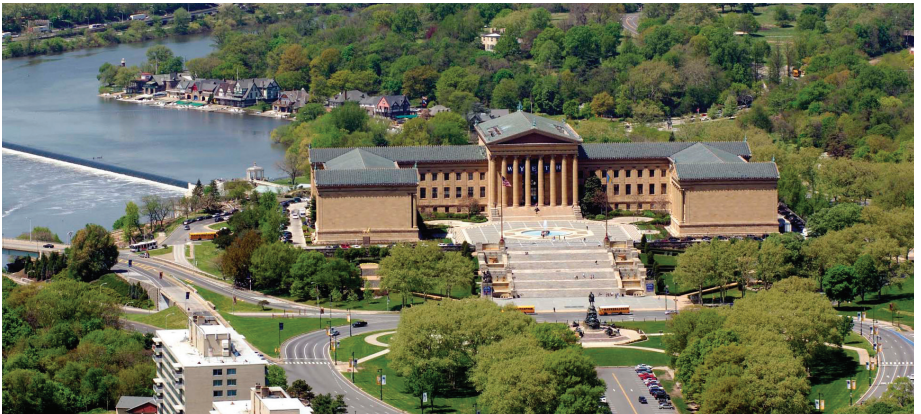
Philadelphia Museum of Art