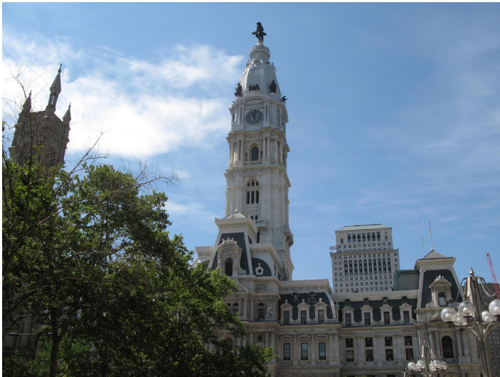
Philadelphia City Hall

Conference pre-registration is required, and the registration deadline is Thursday, Sept. 15, 2022, or until capacity is reached. Registration is limited, so register early to secure your spot. Note: CME credit given for in-person conference only.